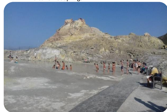
Vulcano Hot Springs

We drive through spectacular scenery and via the pretty sun kissed town of Milazzo from where we'll sail to Vulcano. The island takes its name from considerable volcanic activity that has taken place for thousands of years. Along with Stromboli it is the only volcano still active in the archipelago and the youngest at 90 thousand years compared to Stromboli's 100 thousand years. Dinner.