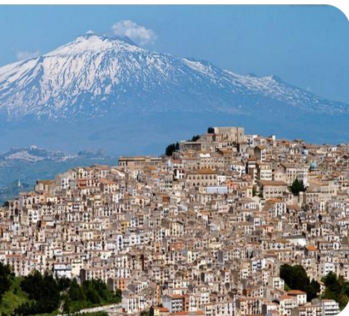
Views of Etna

SanSaba: here the coastline alternates between sand and gravel, laped by warm crystal clear sea. It is a very quiet place so as to attract the sympathy of various naturists. The Gay beach is about 1000 yards away. Stroll along SanSaba sea front, swim in crystal clear sea, or sample a local homemade ice cream, or ever better a cup of Gelo di Melone, a watermelon delight to lick your whiskers.